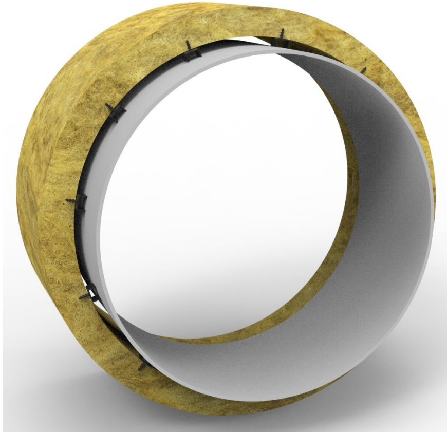
Figure A3 - Spacer arrangement on 24 inches. pipe