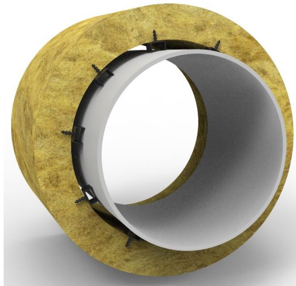
Figure A2 - Spacer arrangement on 12 inches. pipe