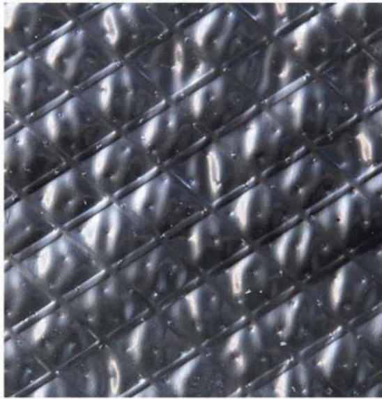
OLD VERSION OF INSULRAP 50-SJ

Insulrap™ 50-SJ-NG is the “Next Generation” of self-healing vapor barrier membranes used on insulated piping in ammonia refrigeration, oil and gas, LNG, cryogenic, tanks and vessels, and chemical processing applications.